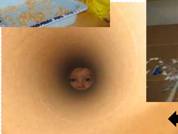
← The view from a paper towel roll!